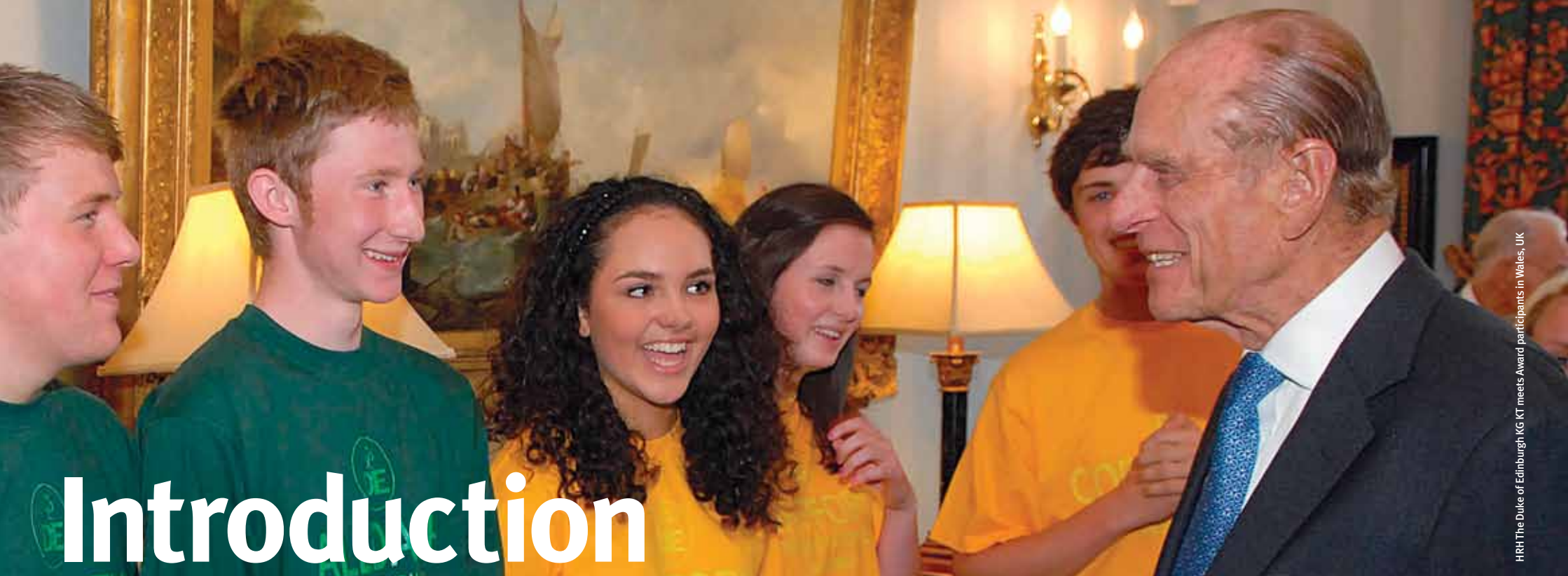
HRH The Duke of Edinburgh KG KT meets Award participants in Wales, UK